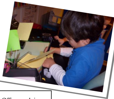
Office work in our Early Years Department