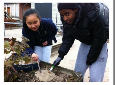
Digging for dinosaurs with KS3